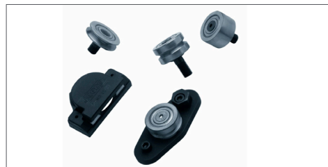
Vee guide wheel technology provides long-lasting motion, even in extreme applications