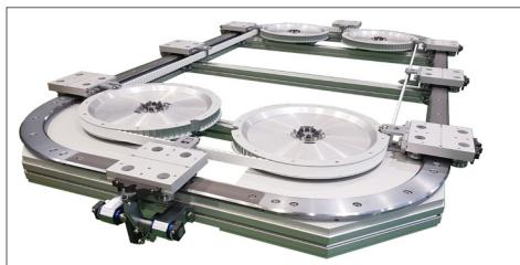
Rectangular DTS providing space for internal process machinery and scanning

The oval shaped track system also allows the input and output sections to be located close together, making one-person operation possible. Conveniently, one person can reach both the input station where the raw material is loaded and the output station where the finished pouches are released, saving costly labor.