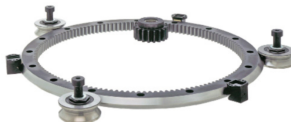
HDRT HEAVY DUTY RING SYSTEM WITH GEAR CUT AND PINION

The bandsaws were replaced by a plasma cutting machine. The cutting head of the plasma system has two plasma torches. They are placed opposite each other and rotate during the cutting process on a circular path 180° around the steel tube. One cutting head is responsible for the upper half of the pipe, the other for the lower half of the pipe. A complete pipe cut takes between five and ten seconds, depending on the tube diameter and thickness. The holding and guiding of the whole cutting head is done by two HepcoMotion HDRT guide systems.